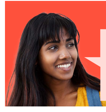
What if my partner for the Speaking test has better speaking skills or a very different personality?

Don't worry. Examiners are specially trained for situations where candidates have different abilities or personalities. Everyone will have the chance to show their best speaking skills in the test.