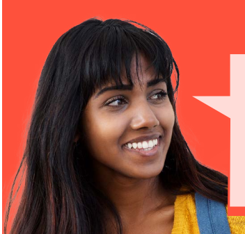
What if I don't understand all the words in a reading text?

Just continue reading and try to understand as much as possible. Use the context to help you. In the exam, you can't ask what a word means nor use a dictionary, so it's important to be able to read without stopping to look up all the words.