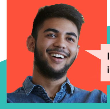
Is there a spell-checker in the digital test?