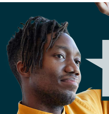
In the digital exam, can I see all the text and questions at the same time?

You might have to scroll up and down to read the whole text and see all the questions in the digital exam paper.