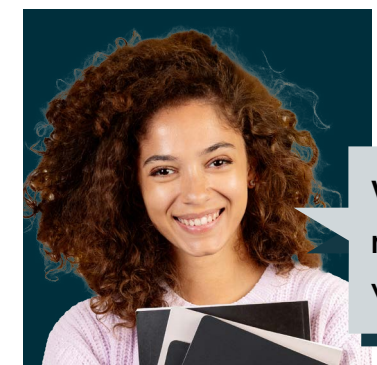
What if I write too much, or if I don't write enough?

The instructions in the test will tell you how much to write. The most important thing is to answer the question completely and clearly. If you write too much, you might waste time or include unnecessary or confusing details. If your answer is too short, you might miss some important information! The digital Writing test has an automatic word count and you can easily edit your work.