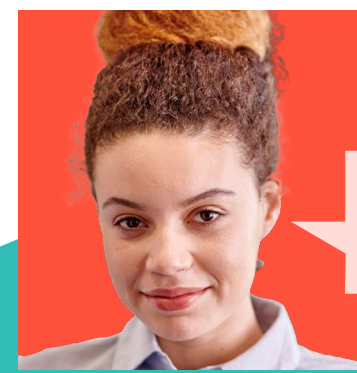
How important is spelling in Part 3?

It's OK to make some small spelling mistakes in the Listening paper of this exam, but it must be clear what you were trying to write. And if the recording gives a word letter by letter (for example, a person's name), then you must spell this correctly.