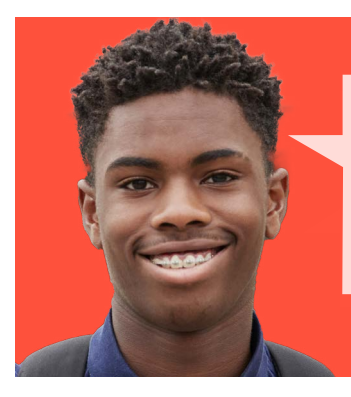
What if I don't understand all the words in a reading text?

Just continue reading and try to understand as much as possible. Use the context to help you. In the exam, you can't ask what a word means nor use a dictionary, so it's important to be able to read without stopping to look up all the words.