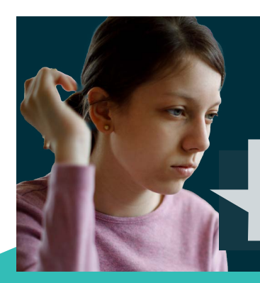
Is there a spell-checker in the digital test?

No! It is important to check your own answers and spelling before the end of the test.