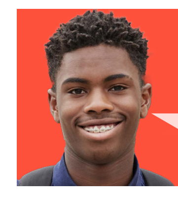
How long should I spend on each part?

Both parts are worth the same number of marks and you can decide how much time to spend on each part. Just make sure you don't forget to spend some time planning before you start writing each answer and checking your work after you have finished.