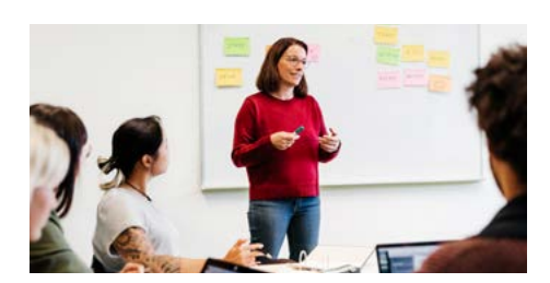
Teacher assessment in preparation for English as a medium of instruction (EMI) courses

Ensure your students meet exit requirements