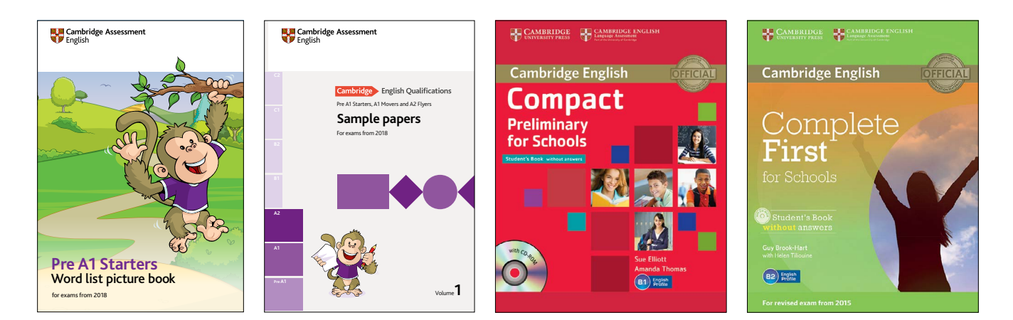
Some of the many materials available