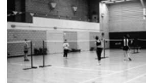
a sports hall