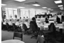
a study centre