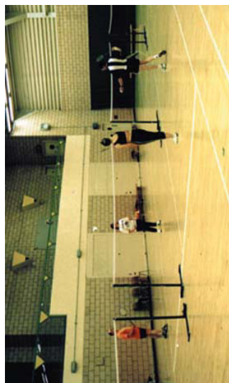
a sports hall