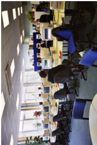
a study centre